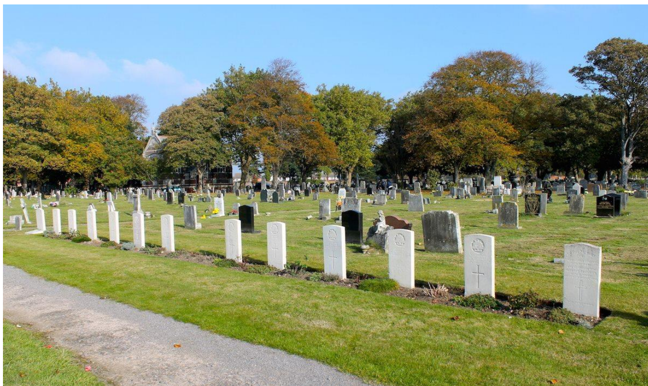
Australian War Graves in Milton Cemetery, Portsmouth