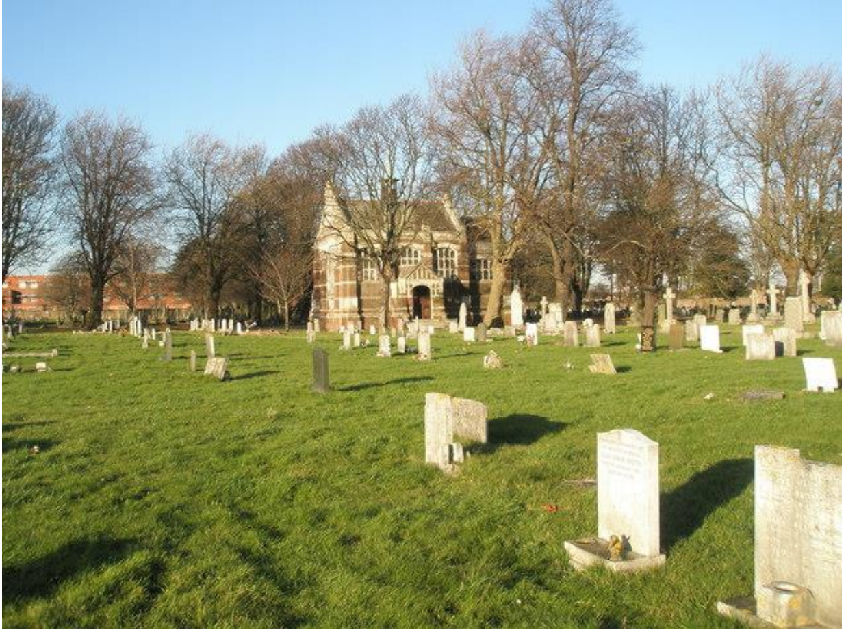
Cemetery Chapel at Milton Cemetery, Portsmouth