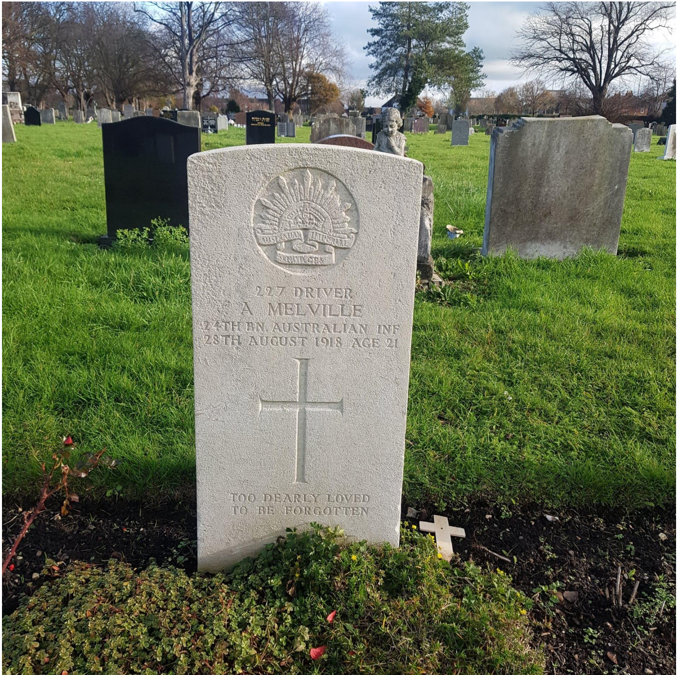
Photo of Driver A. Melville's Commonwealth War Graves Commission Headstone in Milton Cemetery, Portsmouth, Hampshire, England.