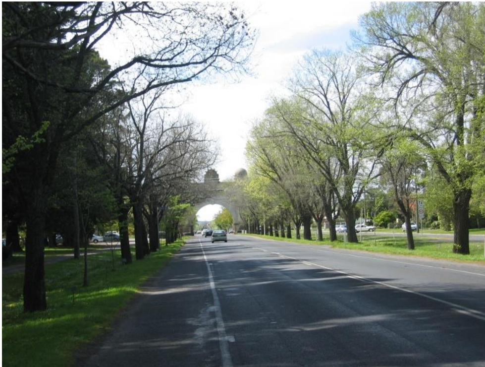
Ballarat Avenue of Honour